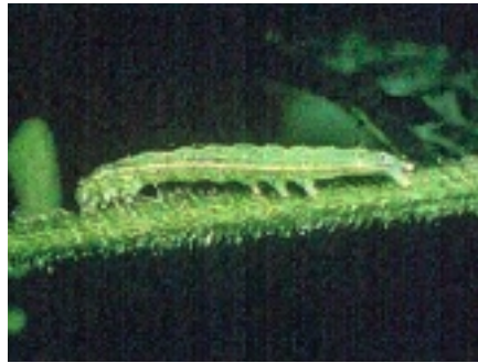
Figure 4. Green cloverworm caterpillar.